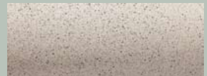
SAT - Sand Textured Powdercoat premium finish

Premium Powdercoat finishes carry a small up-charge and may require additional lead time.