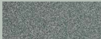
VET - Verde Textured Powdercoat