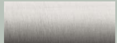
BSS - Brushed Stainless premium finish