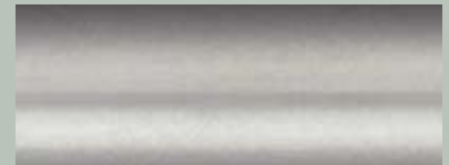
CHS - Chrome Smooth Powdercoat premium finish