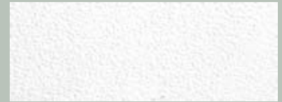
WHT - White Textured Powdercoat