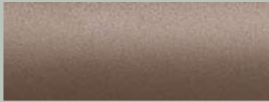
BRT - Bronze Textured Powdercoat