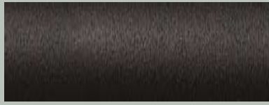
BKT - Black Textured Powdercoat